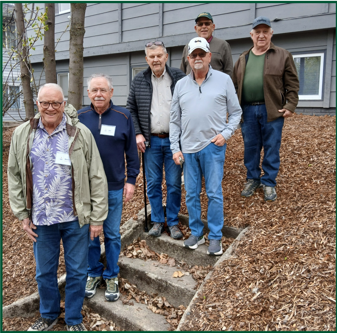
Alumni from the 1960's Standing on Steps Near the Original House 75th Anniversary 2025.