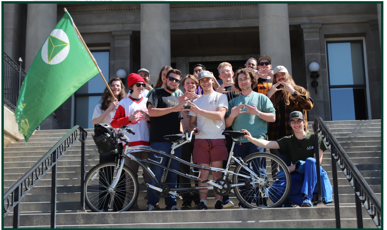
Gamma Iota members reaching the capitol for the 62nd annual Bike to Boise.