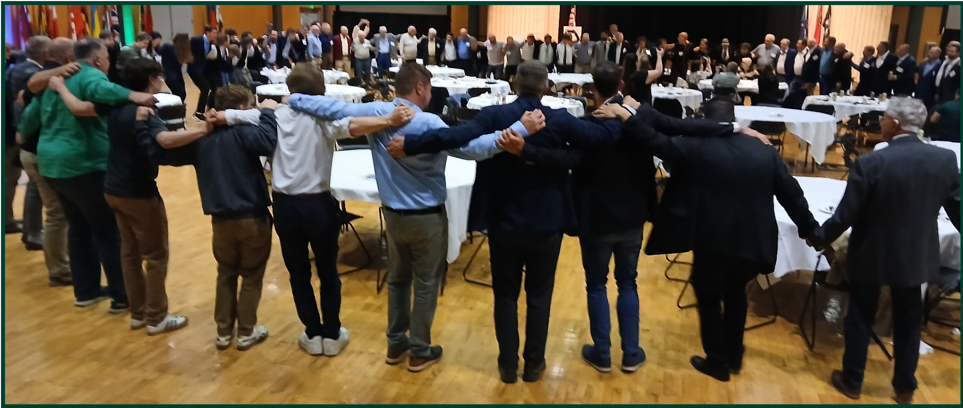
The 75th anniversary attendees singing "The Emblem" - WE ARE THE MEN OF DELTA SIGMA PHI!!!