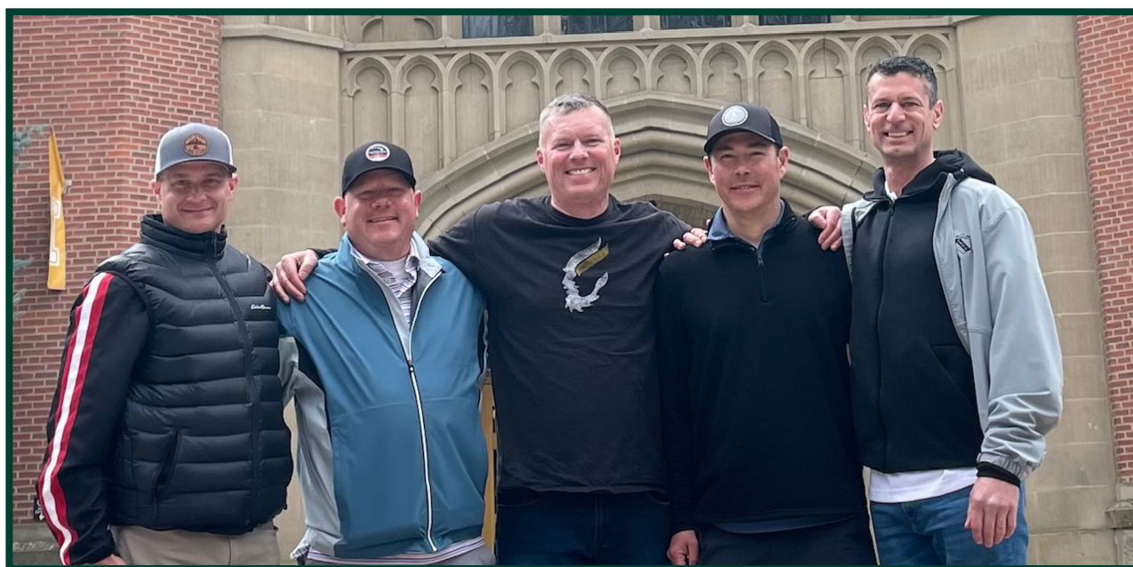
Brothers from the 90's in front of Admin Bldg. 70th in 2022.