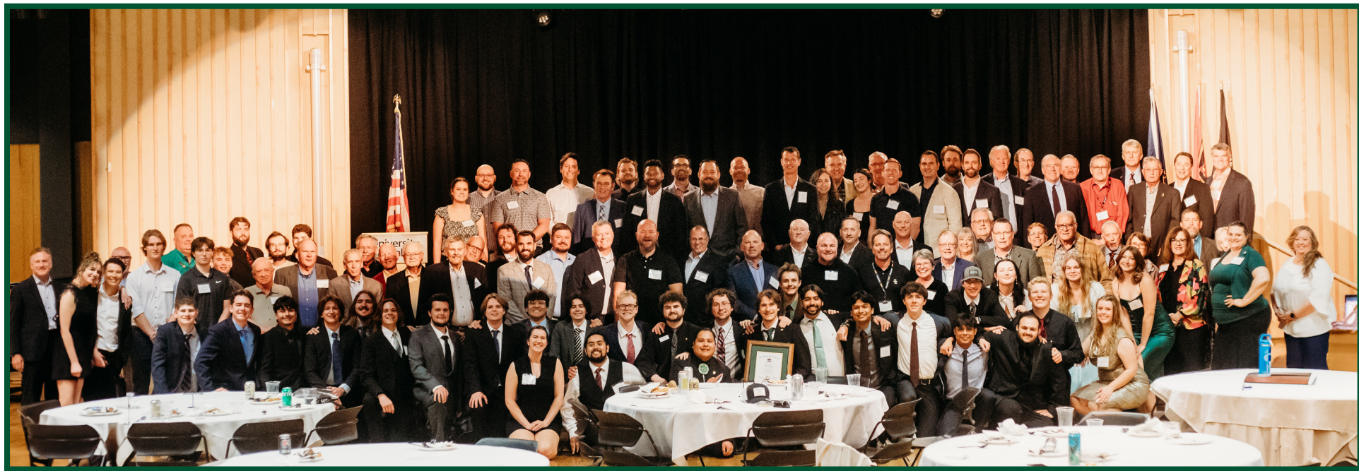
The Gamma Iota 75th anniversary celebratory dinner featuring undergrads, alumni, and long time supporters of the fraternity